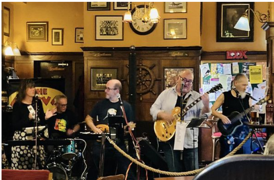
THE ENTERTAINING PORTSMOUTH BAND 'THE MUVVAS'