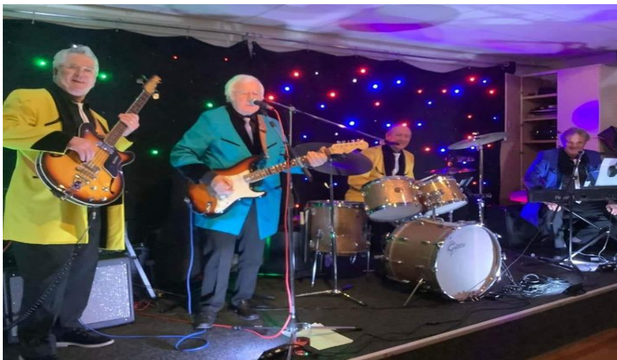
GOSPORT BASED BAND CHEVY 55 Rock 'n' Roll